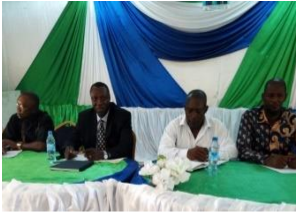
In Bo DG addresses Civil Servants in the South

The second monitoring exercise of IPAS in November 2018 in the regions was led by the Director General (DG). Civil Servants in the regions for over 30 years had the opportunity to meet and interact with the DG, discussed, and shared knowledge on pertinent Management and Welfare issues relating to the Civil Service.