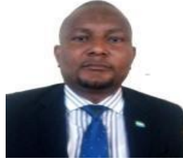
Dir. Corp & Admin