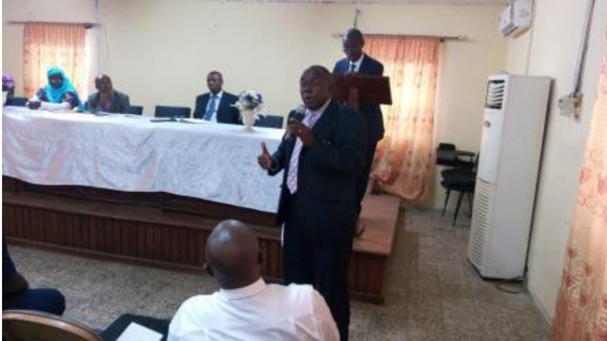
Leadership meeting of Permanent Secretaries) and Professional Heads (Source PMD, 2018)

In March 2019, the difficulties in target setting led us, through the advice of the Director General, to develop sample generic targets for Common Cadre Personnel (CCP) in Grades 1-6 (Higher Executive Officers, Confidential Secretaries, Data Entry Clerks, Drivers, etc.)