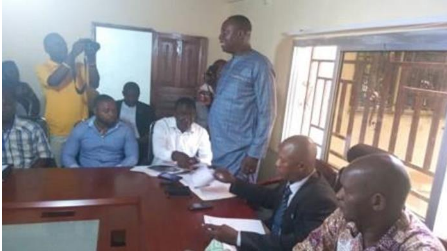
DG addresses Civil Servants in Kenema