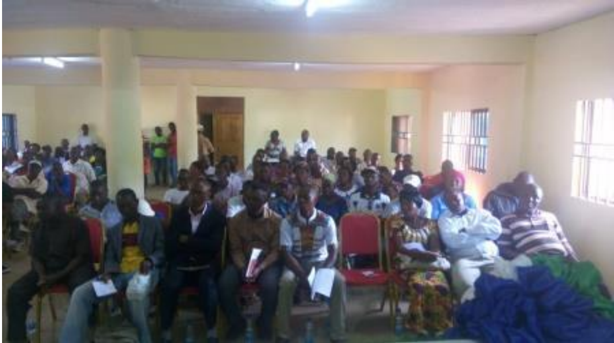
Civil Servants in the North West region listening to DG in Port Loko Town