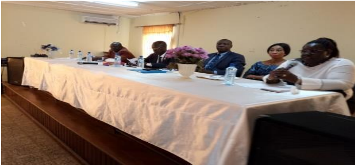
Opening ceremony on Quality Productivity Improvement training at CSTC

Additionally, as part of our commitment to foster the skills required for a career in the civil service, we focused on Training and Career Development programmes for the civil service. The following activities were undertaken to help build the capacity of civil servants in order to realize their full potentials: