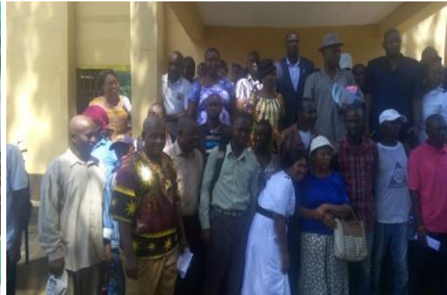
Photo of DG and Civil Servants in Port Loko