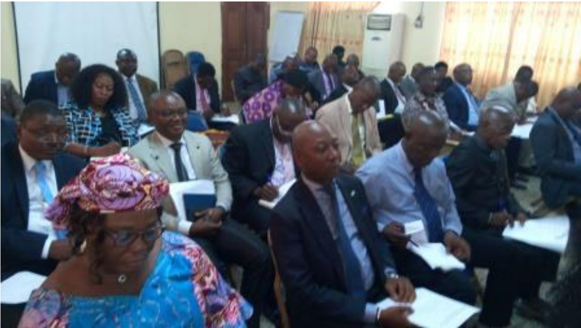
A cross section of the Civil Service leadership

With the assumption of the Director General, the leadership meeting of PSs and PHs was resuscitated and for 2018, two meetings were organised at the Civil Service Training College (CSTC) with the Secretary to President (SP) and the Secretary to Cabinet and Head of the Civil Service (SCHOCS) in attendance. The Leadership meetings were primarily conducted to make decisions and to ensure that the civil service’s strategic policy issues are determined to realize its goals and aspirations in an effective and efficient manner.