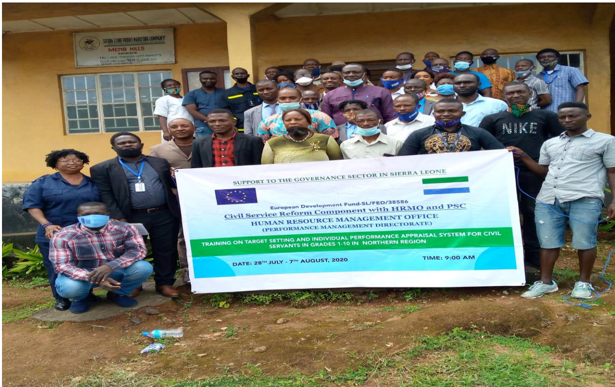
Participants group in Bombali District