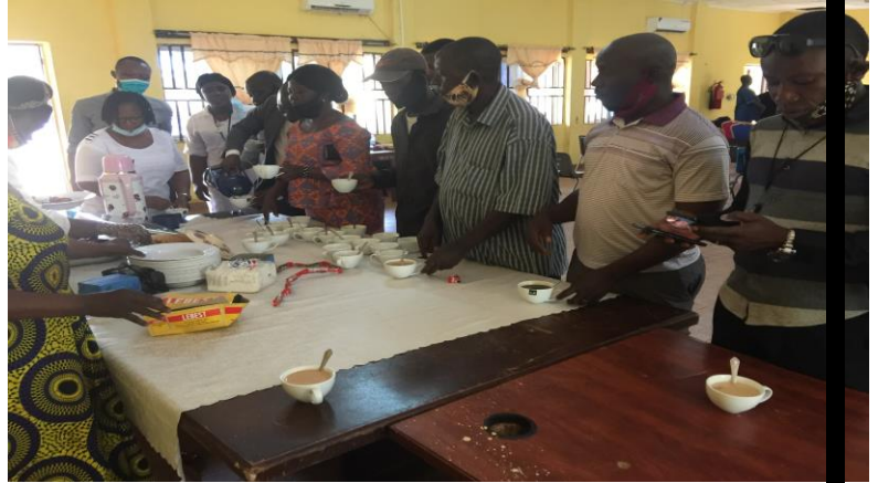
Participants taking tea break