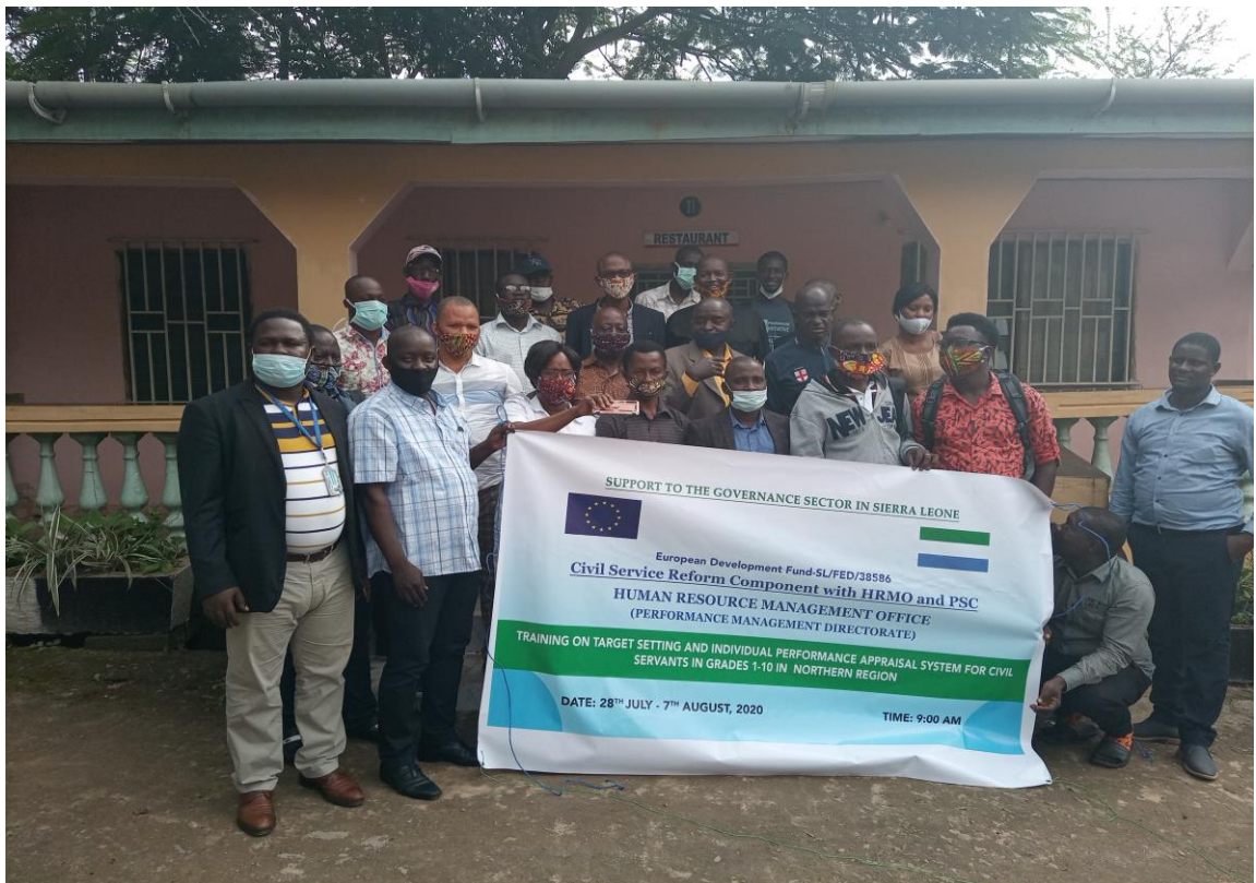
Participants group photo in Koinadugu District