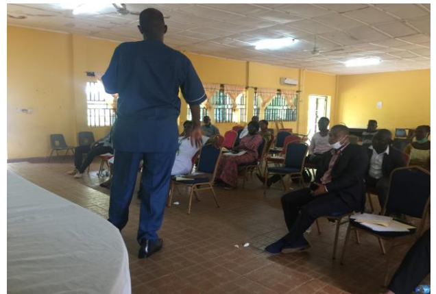
The Director –Performance Management giving lectures on IPAS