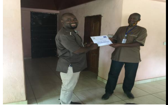
Participant receiving Certificate in Koinadugu District