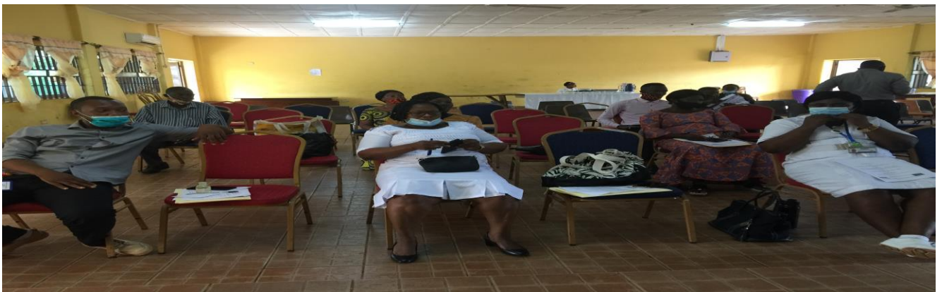
Participants receiving lectures on IPAS Koinadugu District