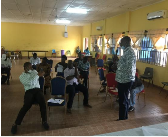
DG-HRMO Responding to questions in Tonkolili