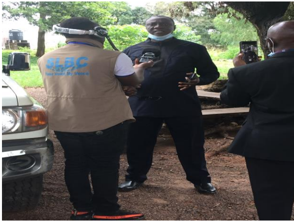
The DG-HRMO Giving Interview with SLBC