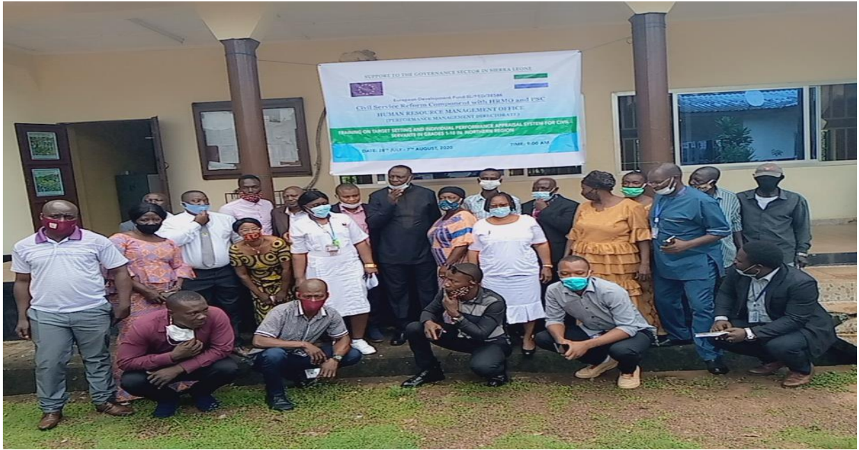
Participants group photo Tonkolili District