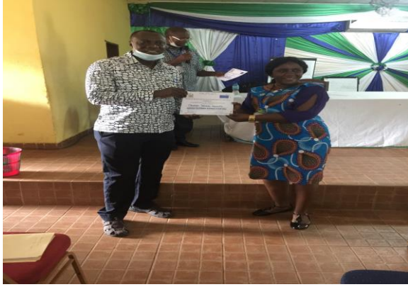
Participant receiving certificate in Tonkolil Dist.